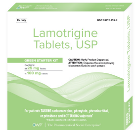
Green Starter Kit: Total 98 Tablets (84 X 25mg) (14 X 100mg) NDC 69102-359-11

Pharmacists: Please use the NDC numbers listed above to place orders.