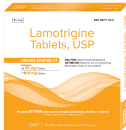
Orange Starter Kit: Total 49 Tablets (42 X 25mg) (7 X 100mg) NDC 69102-137-10

If your insurance covers Lamotrigine Starter Kits, pay as little as $5 for any Lamotrigine Starter Kit. If your insurance does not cover the Starter Kit, or you pay cash, pay as little as $50 for any Starter Kit.