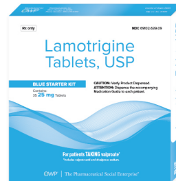
Blue Starter Kit: Total 35 Tablets (35 X 25mg) NDC 69102-639-09